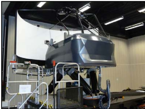
Fig. 1. Ultimate simulator initial design

The well-known Ultimate Driving Simulator has been refurbished. The initial design used an open cabin. The new simulator uses a Renault Twingo cabin.