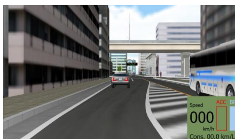
Fig.3. The drivers view at the start of the simulated drive

The driver was required to move across into the right hand lane in order to carry out the right turn junction manoeuvre. The driver then had to navigate the various road user scenarios, turning right when safe to do so. Upon turning right the driver had to get over to the far right hand lane so that they could exit the triple-lane carriageway via a single lane slip road on the right of the carriageway (situated at 0.25 km from start [3]). The slip road followed a steep incline then levelled out (at 0.55 km from start [4]) onto a short dual carriageway strip of road in which the left hand lane was closed with a series of cones. The driver was then faced with two toll booths (at 0.74 km from start [5]) and instructed to go through the one on the right hand side. Upon approach the toll booth barrier opened to allow the driver to pass. Shortly after the toll booth, the driver was required to merge with heavy traffic to join a dual carriageway on the left. The dual-carriageway continued until reaching a fork in the road (at 1.15 km from start [6]). At the fork, the driver was required to branch left and drive for a short distance before a sign appeared on the screen signifying the end of the simulated drive (at 1.23 km from start [7]).