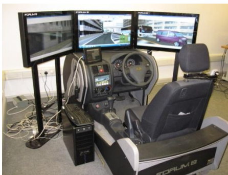
Fig.1. Forum 8 driving simulator

Three scenarios requiring the driver to interact with other road users were included in the simulated drive. The first scenario occurred at cross roads, in an urban setting, during a right turn manoeuvre and involved moving and stationary opposing traffic (cars, buses and lorries). The next scenario involved an opposing motorcycle passing through the junction. This was followed by a child on a bicycle crossing the road into which the driver was turning. The final scenario involved heavy traffic flow (cars and lorries) travelling in the same direction as the driver during a merge manoeuvre on a dual carriageway road.