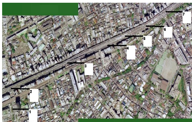
Fig.2. Plan view of the route and surrounding environment

The driver was required to move across into the right hand lane in order to carry out the right turn junction manoeuvre. The driver then had to navigate the various road user scenarios, turning right when safe to do so. Upon turning right the driver had to get over to the far right hand lane so that they could exit the triple-lane carriageway via a single lane slip road on the right of the carriageway (situated at 0.25 km from start [3]). The slip road followed a steep incline then levelled out (at 0.55 km from start [4]) onto a short dual carriageway strip of road in which the left hand lane was closed with a series of cones. The driver was then faced with two toll booths (at 0.74 km from start [5]) and instructed to go through the one on the right hand side. Upon approach the toll booth barrier opened to allow the driver to pass. Shortly after the toll booth, the driver was required to merge with heavy traffic to join a dual carriageway on the left. The dual-carriageway continued until reaching a fork in the road (at 1.15 km from start [6]). At the fork, the driver was required to branch left and drive for a short distance before a sign appeared on the screen signifying the end of the simulated drive (at 1.23 km from start [7]).